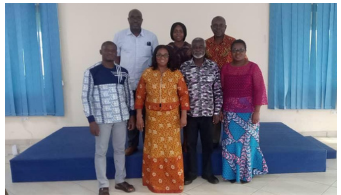
Work Package 1 with Members of Africa Regional Training Center (ARTC)

A Journey of Passion and Perseverance ~ page 7