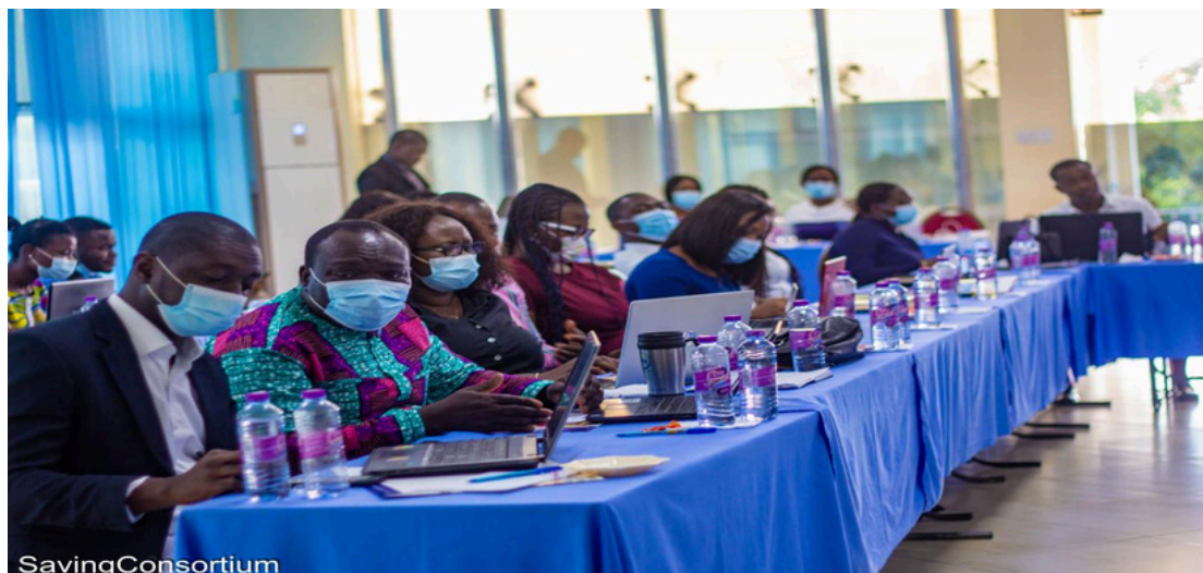
One of the MOOC sessions

Let's delve into the details of this transformative training program.