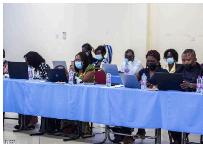
Participants at one of the MOOC sessions

The SAVING Consortium's MOOC has not only imparted knowledge but also ignited a passion for evidence-based implementation. As we continue our journey, we remain committed to strengthening IR capacities and fostering a community of change-makers dedicated to advancing public health in Ghana.