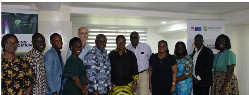
Management Board members