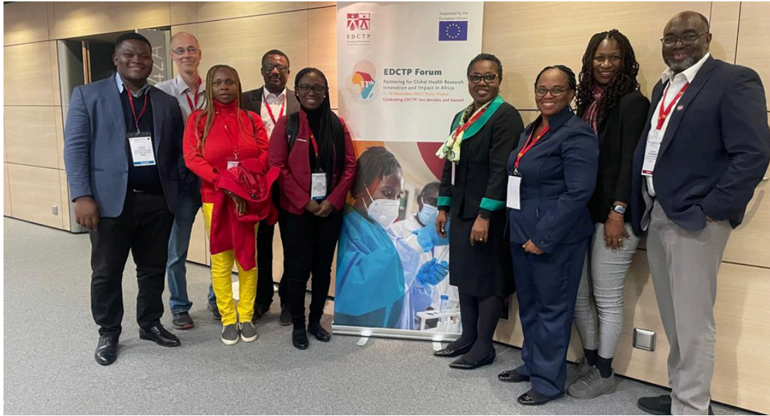
Team SAVING Consortium at the 11th EDCTP Scientific Forum